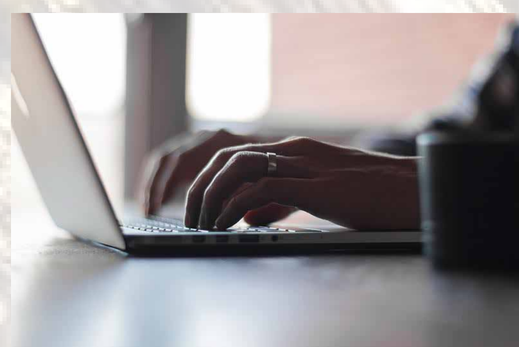
ELECTRONIC AND ELECTRIC DEVICES